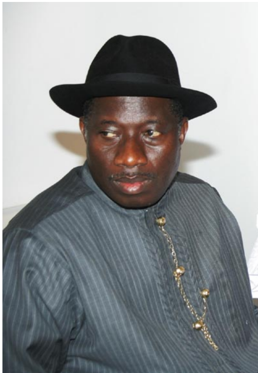
President Goodluck Jonathan