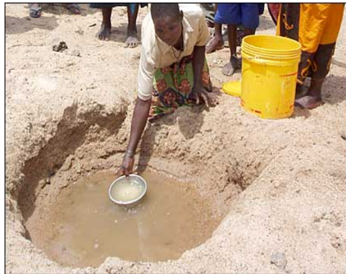
Access to unimproved water supply is widespread in most African countries.

sanitation , which was later adopted by the World Summit on Sustainable Development. In 2008, the second conference, AfricaSan+5 , was hosted in Durban, South Africa by AMCOW and other partners. This coincided with the International Year of Sanitation (IYS) , with the aim to further improve access to sanitation in Africa. Furthermore, this conference produced the eThekweni Declaration , which outlines specific commitments on sanitation by African governments, including raising the profile of sanitation, developing national level plans, establishing a specific sanitation budget line and committing at least 0.5% of national GDP to sanitation.